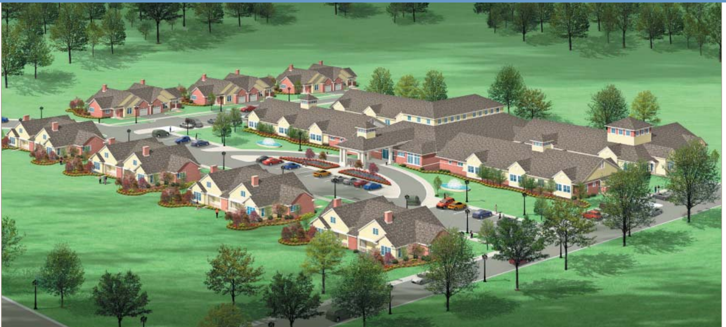
Smith Mountain Lake Retirement Center

Our goal is to provide the highest quality of life. Because our residents become family, we believe you should experience the privacy you need, the comfort you enjoy and the superior care you deserve.